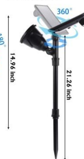
Field cutting install way

Lamp base can rotate left and right by 360° Solar panel can rotate left and right by 360°